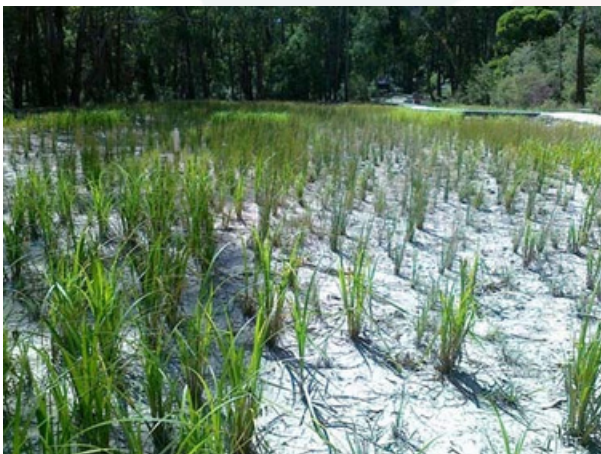
New plants within raingarden