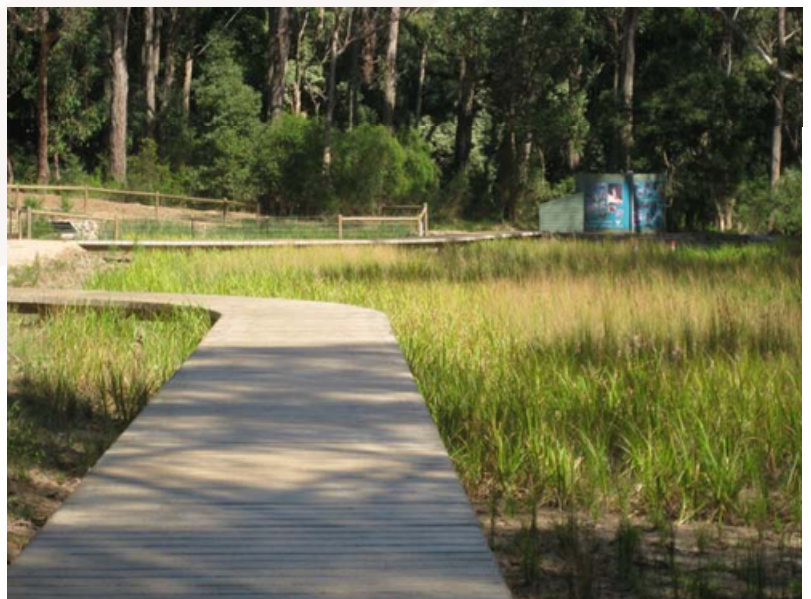
Boardwalks provide access to the bio-infiltration system

2009 – Planning (in concert with Knox WSUD and Stormwater Management Strategy 2010) 2010 – Design and Tender 2011 – Construction