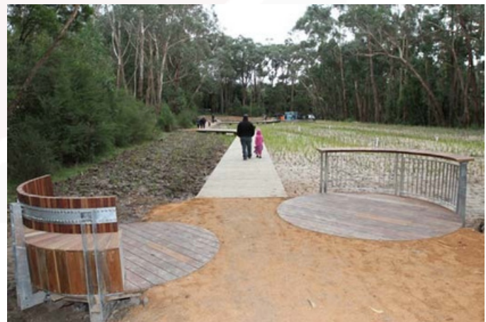
Public seating areas and wooden boardwalks enhance the public realm within Wicks Reserve