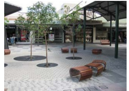
Permeable tree pit section completed