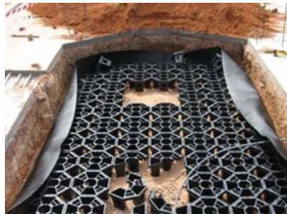
Root cell installation