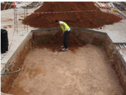
Excavation of one of the permeable tree pit sections

The design of the root cell was important for this project and has contributed to the health of the trees in their first season. The root cell area can hold additional stormwater runoff enabling increased uptake of nutrients, moisture and gases of the entire root cell zone, making the trees more resilient.