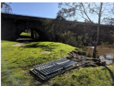
Stormwater outlet to Barwon River