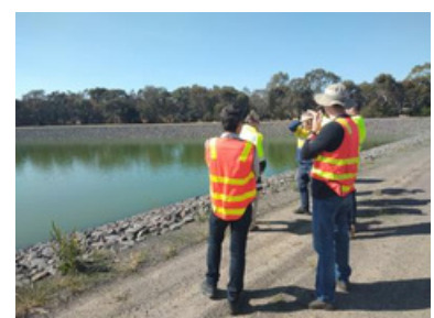
Winchelsea Waste Water Treatment Plant