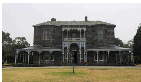
Barwon Park Mansion