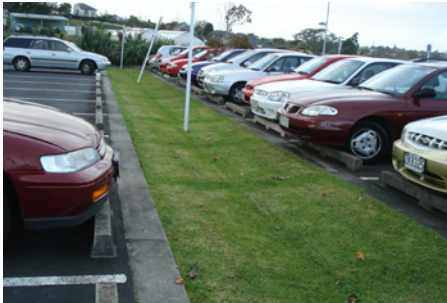
Fig.2 Waitakere City Hospital car park swale