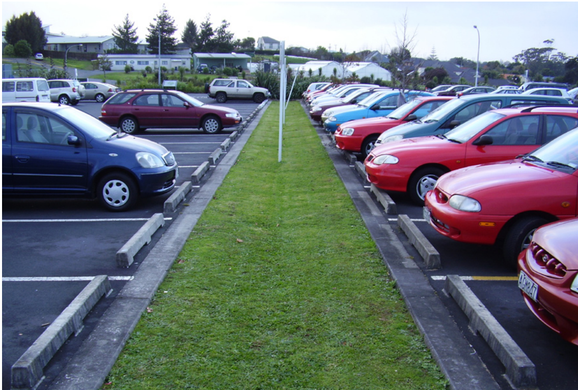
Fig.1 Swale in Waitakere City

Swales, also known as bioretention, filter or infiltration strips, are broad, grass channels used to treat stormwater runoff. They direct and slow stormwater across grass or similar ground cover and through the soil. Swales also help filter sediments, nutrients and contaminants from incoming stormwater before discharging to downstream stormwater system or waterways. Some swales have liners to direct filtered runoff, or rocky linings to slow fast flows. Swales are simple to maintain and can fit well in urban design.