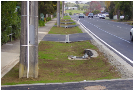
Fig.3 Henderson Valley Road – newly constructed road side swales