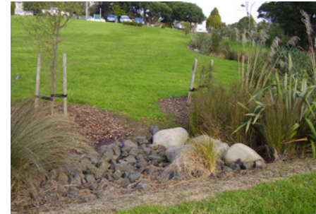
Fig.4 Manawa Wetland vegetated swale